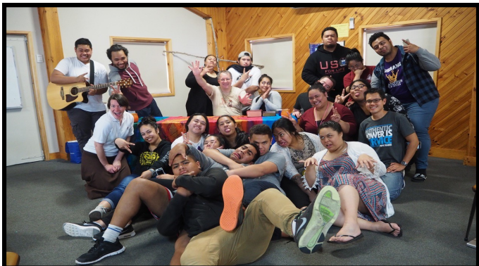
-Parents Passing on the Faith resource from Diocese of Parramatta. Published with acknowledgment to the Bishops Commission for Family Youth and Life.

Think about arranging to go to the same Mass together and maybe going to the beach or a BBQ afterwards. In this way, other families can become like extended family and bring healthy fun into our lives.